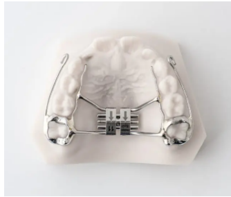
RPE with Facemask Hooks